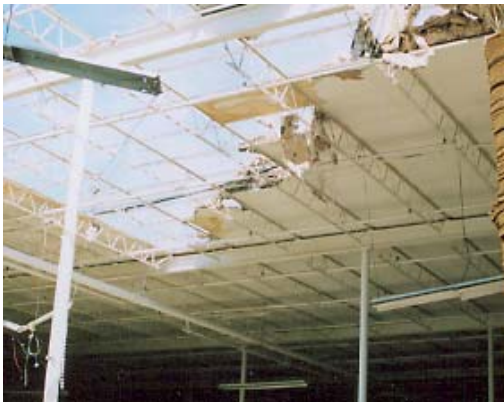
Wind damage from F2 tornado / Dade County March 27, 2003

CBUCK FL Certificate of Authorization #8064